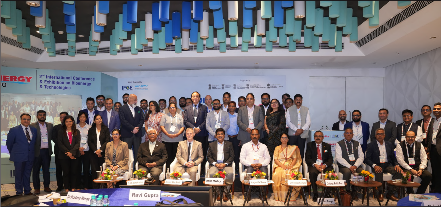
Stakeholders at Bioenergy Conclave